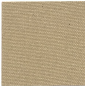
855749 749 TAN