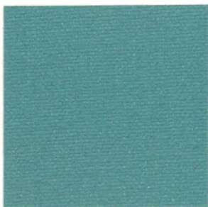
855704 704 TEAL BLUE