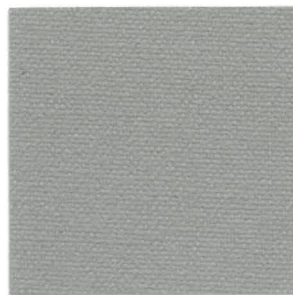
855753 753 PEARL GRAY