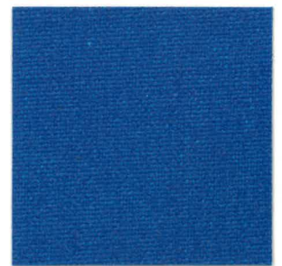
855712 712 ROYAL BLUE