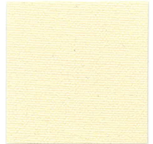
855702 702 BONE WHITE