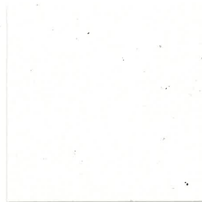
855717 717 WHITE