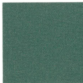
855703 703 FOREST GREEN