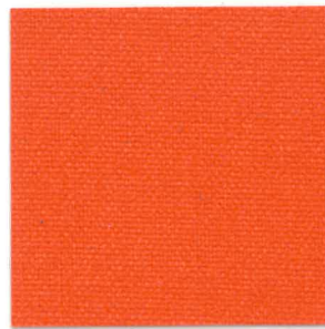
855713 713 TANGERINE