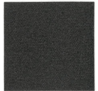
855722 722 BLACK

*Warranty: 5-Year Limited. Starfire Red (855707) color loss is specifically excluded from this warranty. Visit trivantage.com for more information. Colors are representative only. Small variations in shade should be anticipated and are within commercial tolerances.