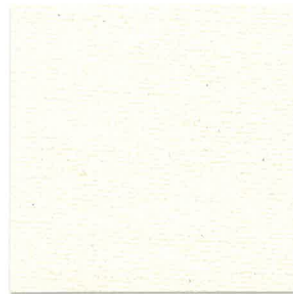
855719 719 OFF WHITE