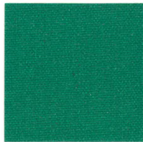
855701 701 EMERALD GREEN