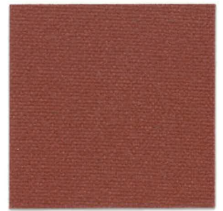
855714 714 TERRA COTTA