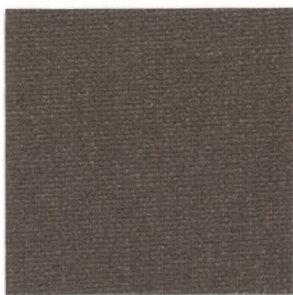
855720 720 BROWN