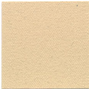
855708 708 EGG SHELL

Starfire® is made from using a pigmented and acrylic top coated cotton fabric. The base fabric on Starfire is a 45% polyester / 55% cotton blend. The Tensile Strength is 283 lbs. x 214 lbs. This fabric is water and mildew resistant. Starfire is a lightweight, yet strong fabric. It is durable, yet flexible and easy to handle. Starfire is put up in 45 yard UPS size rolls. All backed by a 5-year limited warranty*. Flame retardant to standards CSFM Title 19, CPAI-84 (Section 6), and FMVSS-302, ASTM E-84, NFPA-701 Test Method 2.