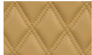
Vertical Double Diamond