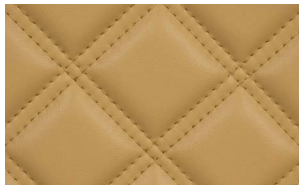
Square Double Diamond