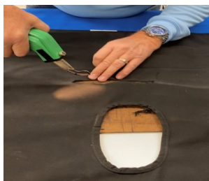
Clean the area