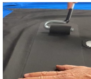
Apply heat and pressure