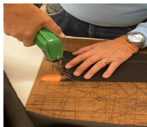
Cut patch to shape