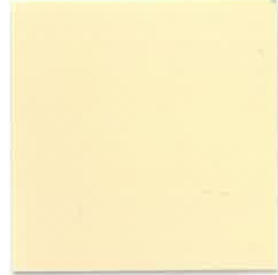
Ivory 968421 / LAC650 7458 (58.5")