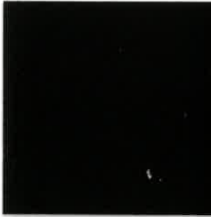
Onyx 968432 / ARCADE FR 0810 (59") 968501 (118")