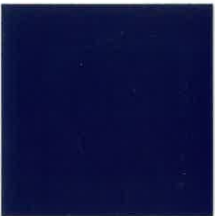
Blueberry 968436 / ARCADE FR 7309 (59")