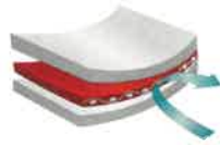
Total coating impregnation of the yarn