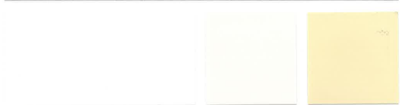
Radiant White 968433 / ARCADE FR 0867 (59") 968500 (118")

FR Standards Met: NFPA 701-10, Method 2, California Title 19 Warranty: 5 years