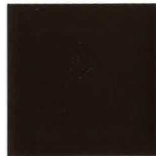
Brown 968414 / LAC650 0887 (58.5")