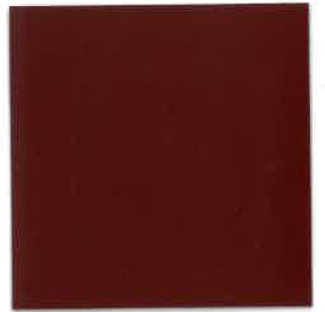
Wine 968440 / ARCADE FR 7426 (59")