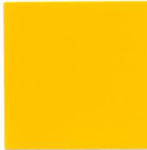
Mustard 968444 / ARCADE FR 7456 (59")