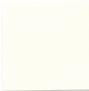
Bone 968422 / LAC650 7462 (58.5")