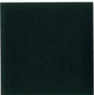
Emerald 968410 / LAC650 0567 (58.5")