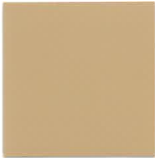
Desert 968418 / LAC650 7409 (58.5")