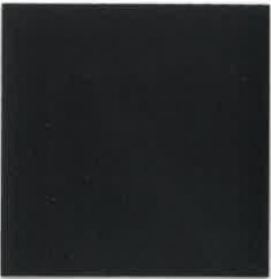
Gun Metal 968419 / LAC650 7419 (58.5")