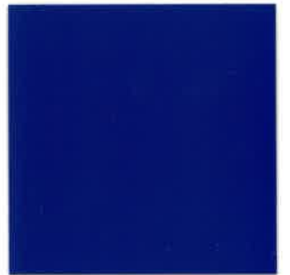
Blue 968446 / ARCADE FR 0941 (59")