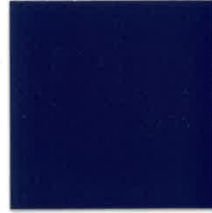
Blueberry 968416 / LAC650 7309 (58.5")