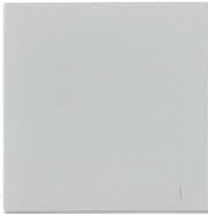
Misty Grey 968411 / LAC650 0654 (58.5")