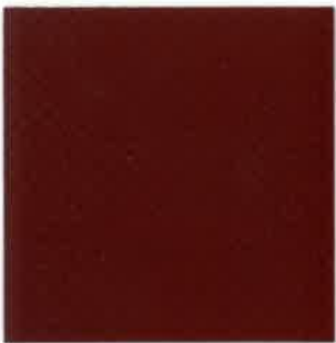
Wine 968420 / LAC650 7426 (58.5")