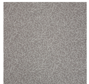
Overdraw Silver 87002-0002