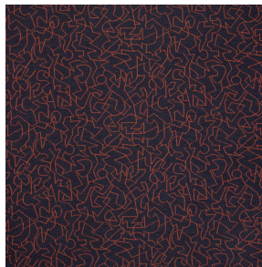
Overdraw Neon 87002-0006