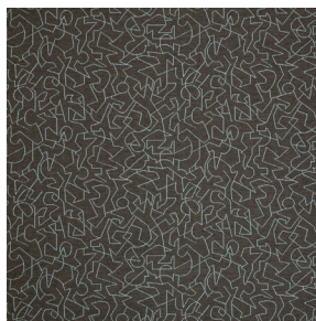
Overdraw Mercury 87002-0001