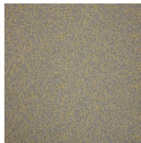
Overdraw Goldenrod 87002-0003