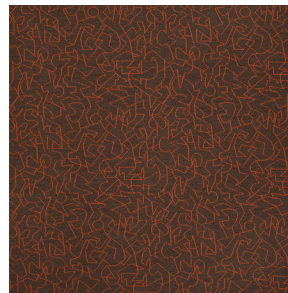
Overdraw Spice 87002-0005