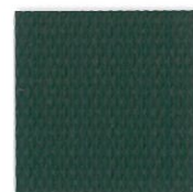
FOREST GREEN 839909 #WT-76FGR