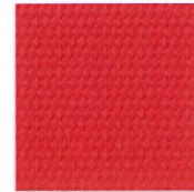
RED 839906 #WT-76RD