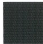
BLACK/BLACK 839970 #WTL-74DSBLK