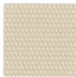
LINEN/LINEN 839973 #WTL-74DSLIN