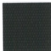
BLACK 839901 #WT-76BK