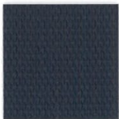
DARK BLUE 839910 #WT-76DBL