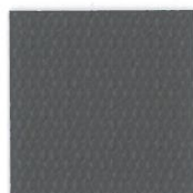
CHARCOAL 839913 #WT-76CHR