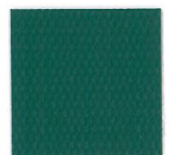
GREEN 839903 #WT-76GR