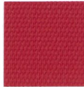
DARK RED 839908 #WT-76DRD