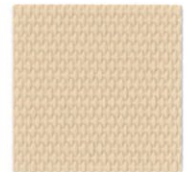
LINEN 839905 #WT-76LN