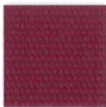
BURGUNDY/ BURGUNDY 839974 #WTL-74DSBUR

California State Fire Marshal Title 19, Section 1237; ASTM E84 Class A; NFPA 701; UL Listed