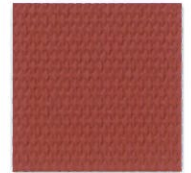
TERRACOTTA RED 839915 #WT-76TRC