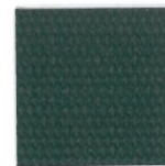
FOREST GREEN/ FOREST GREEN 839971 #WTL-74DSFGR