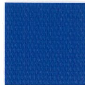
BLUE 839902 #WT-76B

*839930 #WT-54WT 54" White *839940 #WT-60WT 60" White