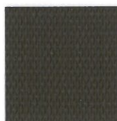
BROWN 839912 #WT-76BWN