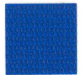
BLUE/BLUE 839972 #WTL-74DSBLU

Lighter colors are more translucent than darker colors. Please hold the card up to the light to see how each color illuminates. Colors are representative only. Small variations in shade should be anticipated and are within commercial tolerances.