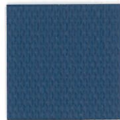
SAPPHIRE/ SLATE BLUE 839914 #WT-76SLT