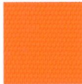
ORANGE 839920 #WT-76ORG