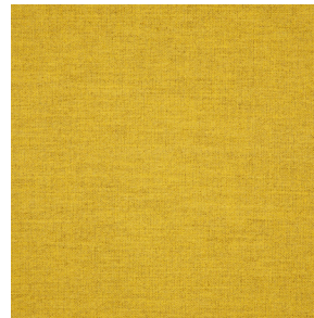
Triumph Dijon 62027-0001