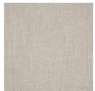
Triumph Stone 62027-0006