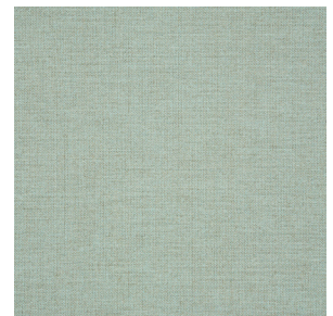
Triumph Mist 62027-0005