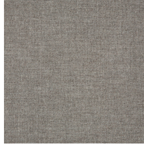
Triumph Slate 62027-0007