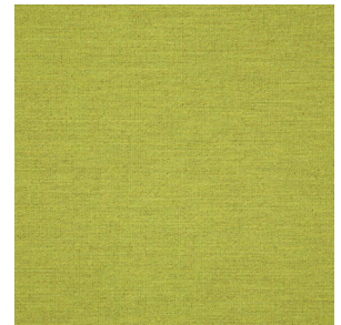
Triumph Leaf 62027-0003